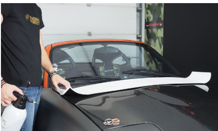
Place the stripe upside down on the hood.