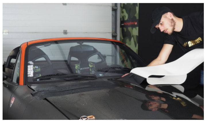
Remove the 2nd part of the white paper.