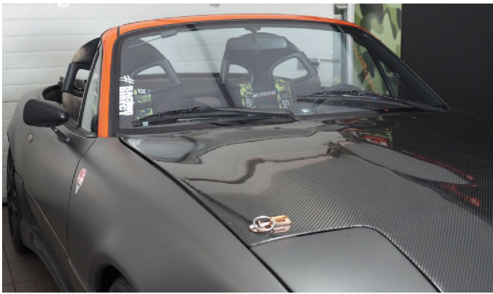
Place the vehicle away from the sun, wind and dust.

Always stick the decal at temperatures above 10°C / 50°F