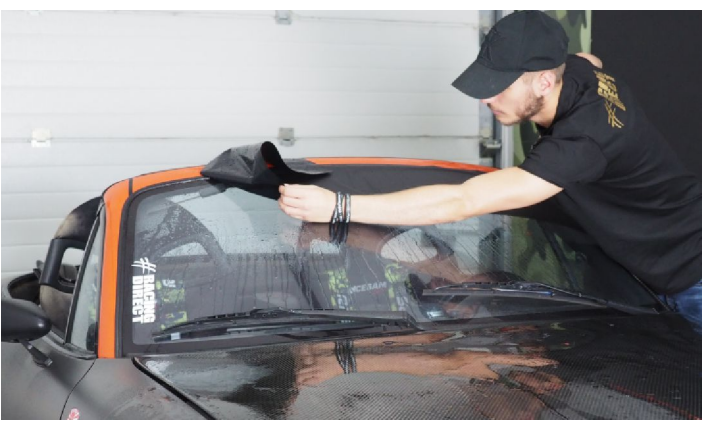
The stripe and windscreen must be completely wet. Lay the strip approximately without seeking to stick it.