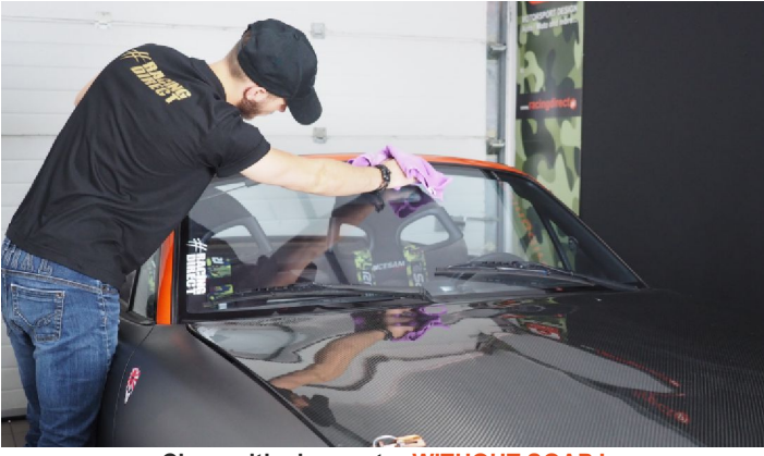
Clean with clear water WITHOUT SOAP ! Dry with a micro-fiber.