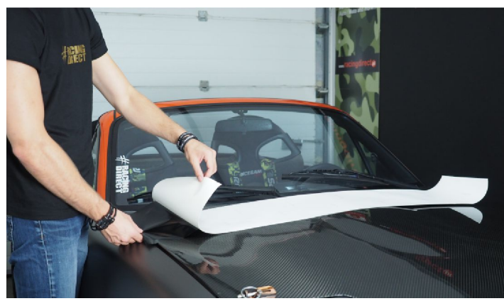
Take off a first part of the sticker from its white paper.