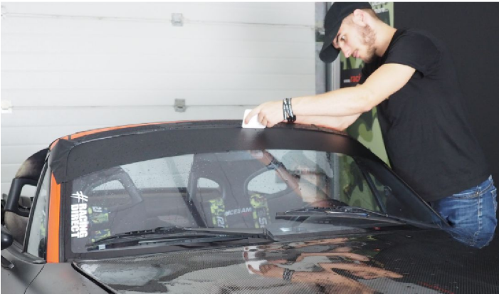
Mark strongly the stripe at the right of the windshield gasket.