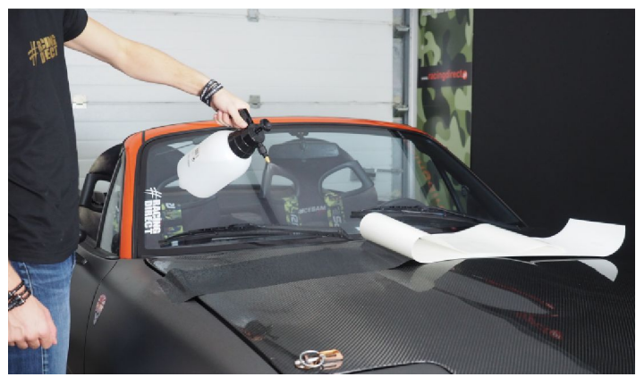
Remove the white support until half of the stripe. Wet the adhesive part of the sticker abundantly. Use only water WITHOUT SOAP !