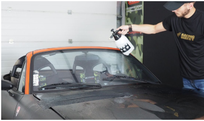
Wet the windshield abundantly.