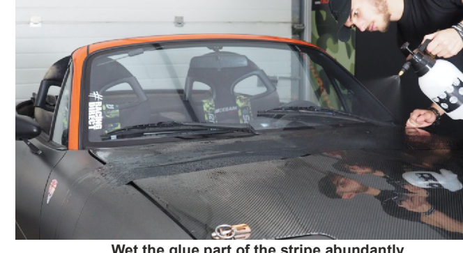
Wet the glue part of the stripe abundantly.