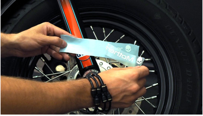
Remove the decal very gently.