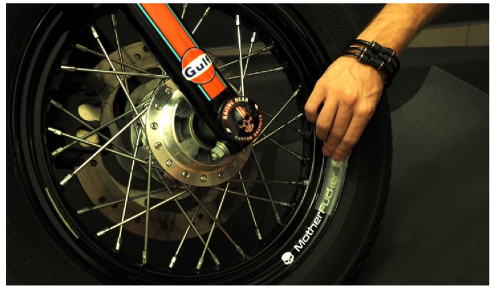
Remove the plastic film very gently.