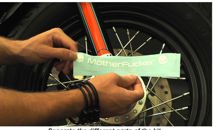
Separate the different parts of the kit.