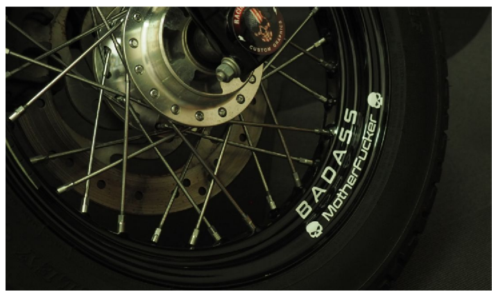
If the kit uses 2 rows of text, paste the 2nd row now.