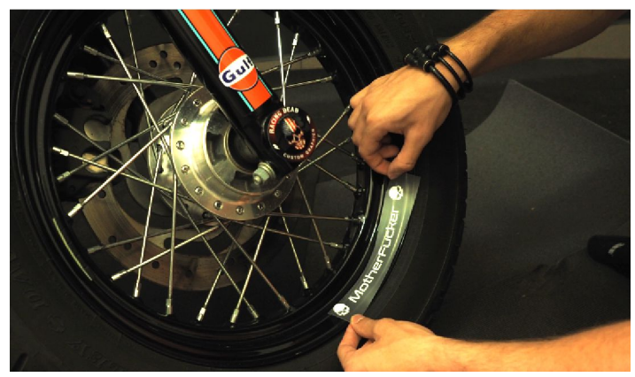
Present the sticker in its final place.