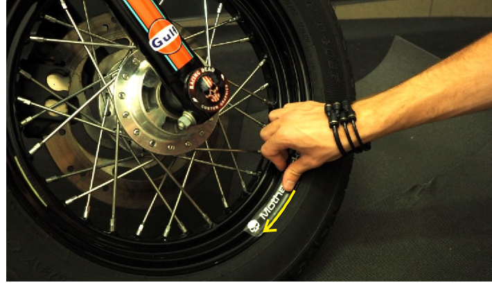
Paste the sticker from the center to the outside. Press firmly and repeatedly on the decal.