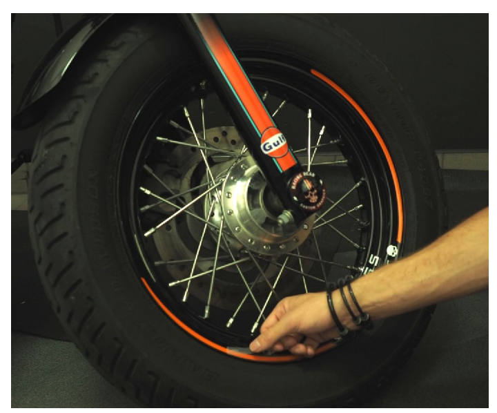
Remove the plastic film very gently.