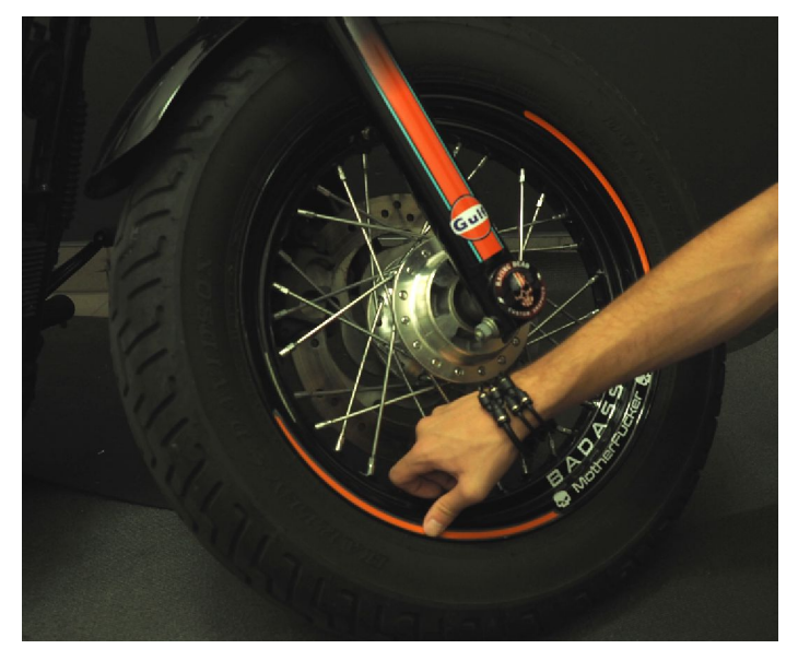
Repeat the same procedure for the stripes. Do not forget to press hard on the decal.